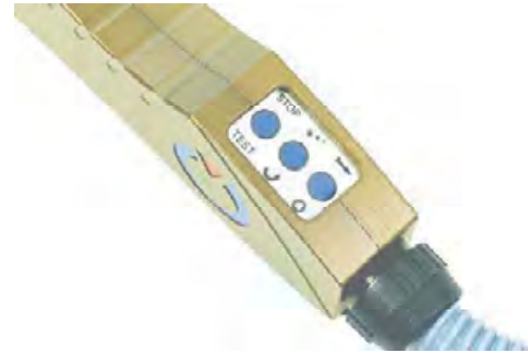
Power Source remote control buttons integrated in the handle