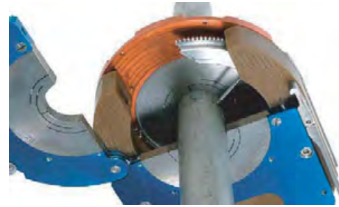
MW 40 with Titanium gas cup